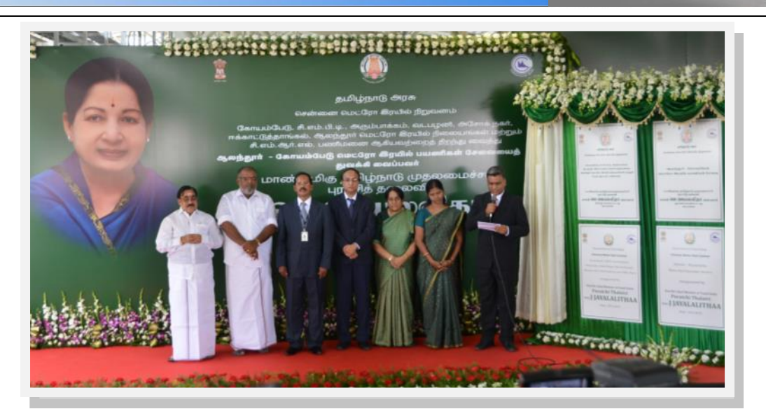
At Alandur during video conferencing