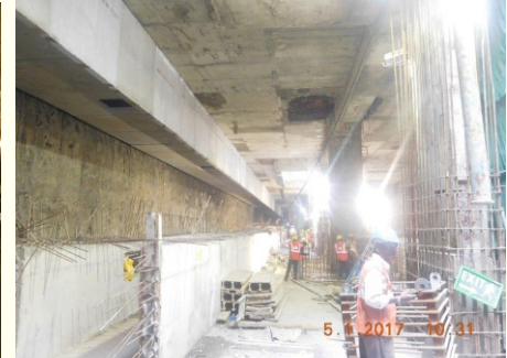
Work in progress in AG-DMS Metro Station