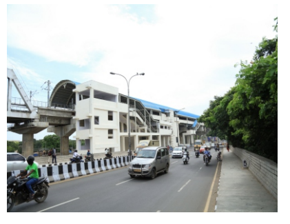
Guindy Metro Station