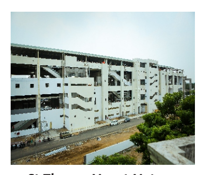
St Thomas Mount Metro Station