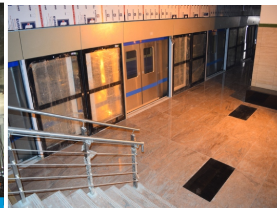
Central Metro Station