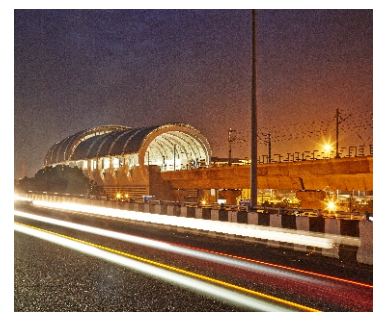
Airport Metro Station