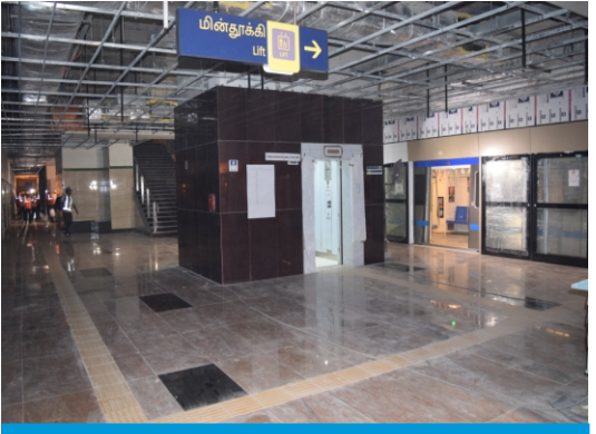
Thirumangalam Metro Station

"We are what our thoughts have made us; so take care about what you think. Words are secondary. Thoughts live; they travel far"