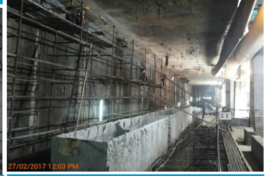
Thirumangalam Metro Station