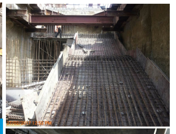
Washermanpet Metro Station