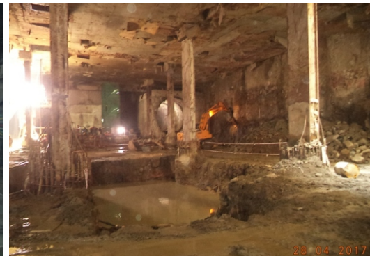
Central Metro Station