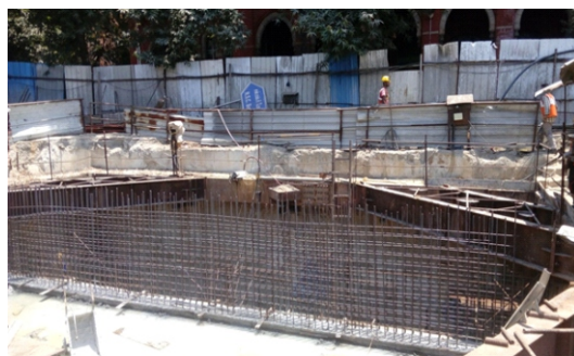
High Court Station