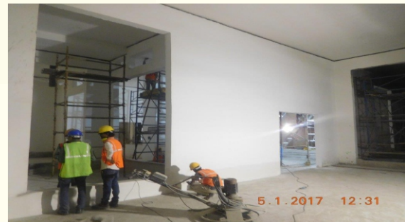
Work in progress Teynampet Metro Station