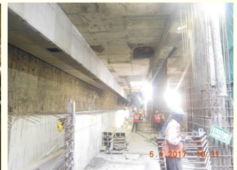
Work in progress in AG-DMS Metro Station