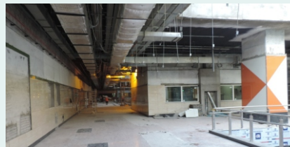
Work in progress at Anna Nagar Tower Metro Station