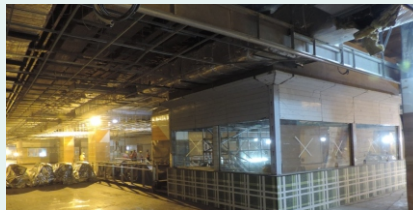
Work in progress at Anna Nagar Tower Metro Station