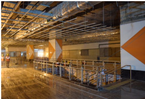
Thirumangalam Metro Station