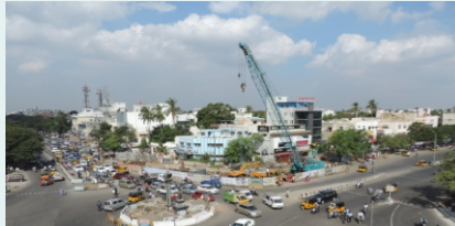
Work in progress at Anna Nagar East Metro Station