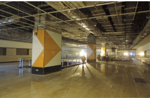
Work in progress at Thirumangalam Metro Station

வியாழனன்று விடிந்தது சரியாயில்லை வியன் தோள்கள் வலித்தது எந்தனுக்கு வெள்ளியன்று விடிவெள்ளி பிறக்குமென்றால் வேதனைதான் மிஞ்சியது நெஞ்சினிலே!