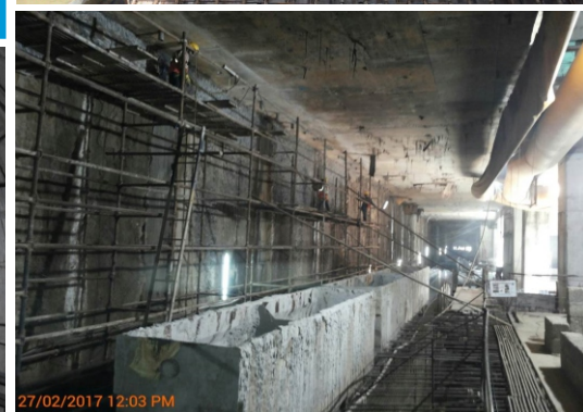
High Court Metro Station

"I alone cannot change the world, but I can cast a stone across the water to create many ripples."