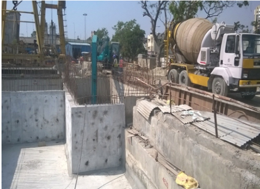
Washerment Metro Station