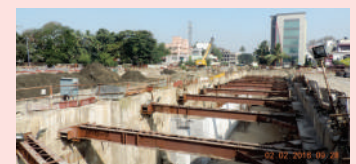
Work in progress at Shenoy Nagar Station