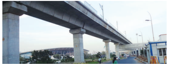
Viaduct works completed between Nanganallur Road and Airport