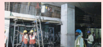
Utility Gallery work at Entrance C in progress at Pachaiyappa's Station