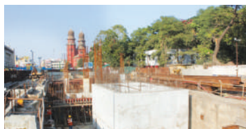
Work in progress at High Court Metro Station