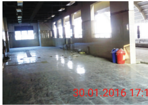
concourse level works in progress at Little Mount Metro station