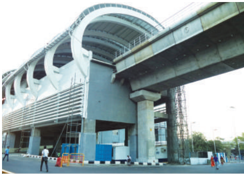
Airport Metro Station