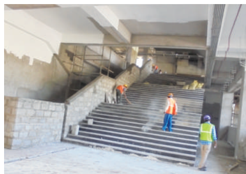
Work in progress at Guindy Station