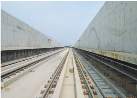
Track Finishing completed at Box section of Meenambakkam

Track work completed for entire depot length of 14606m with 41 turnouts.