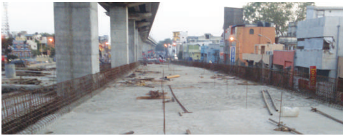
Work in progress at Vadapalani Flyover