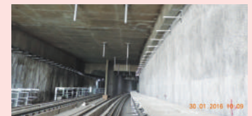
MEP Works in progress at Thirumangalam Ramp