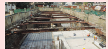
ES 02 Water proofing work in progress at Anna Nagar Tower Station