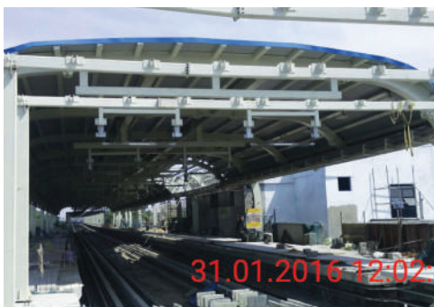
platform roof work in progress at Nanganallur Road Metro Station