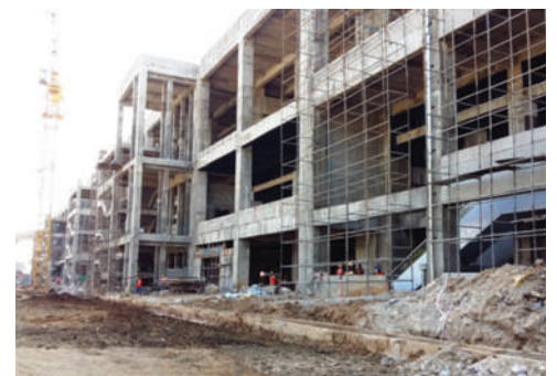
Work in progress at St Thomas Mount Metro Station