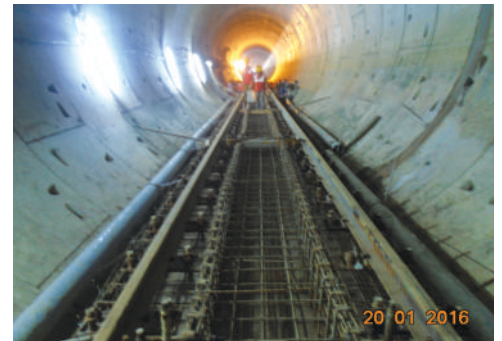
Track made ready for concreting at Tunnel between SAT-SAE