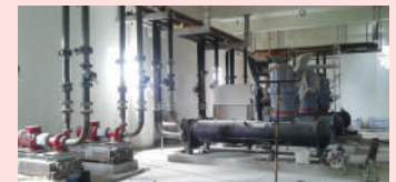
Machinery erection in Ancillary building work in progress at Kilpauk Station