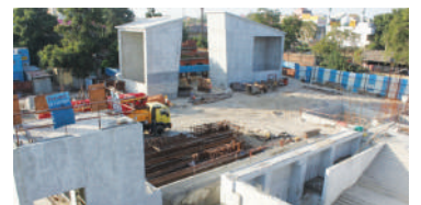
Work in progress at Washermenpet Metro Station