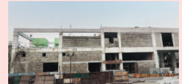
Ancillary building works in progress at Anna Nagar East Station