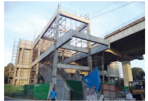
Meenambakkam Metro Station