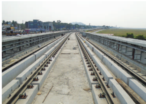
Track finishing completed at Ramp section of Meenambakkam