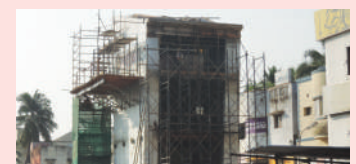
Ventilation shaft work in progress at Thirumangalam Station