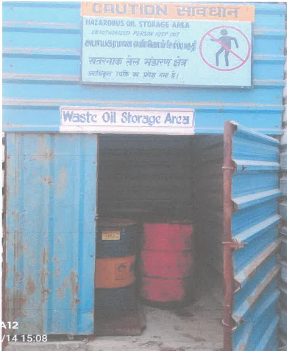
Waste Oil Storage Room