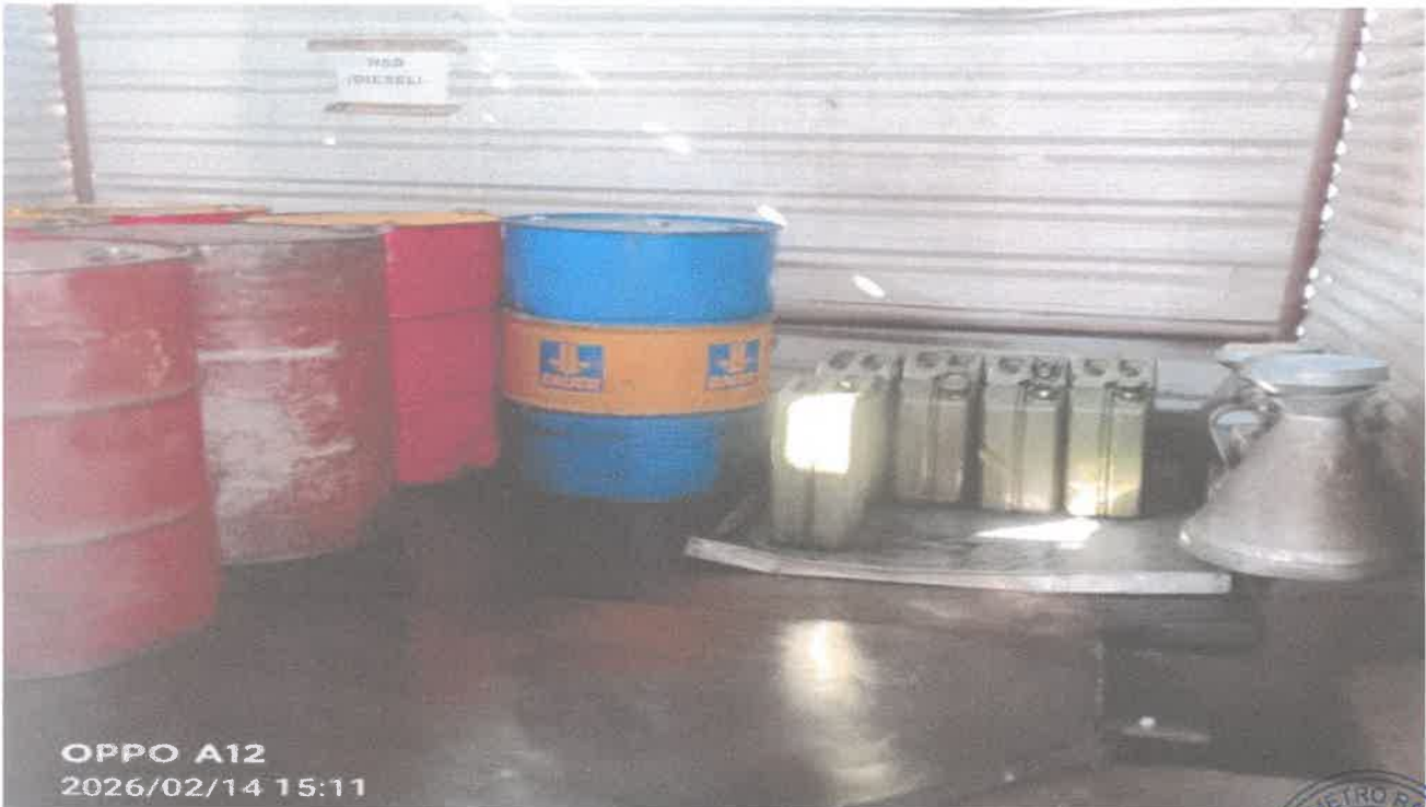
Diesel and Oil Storage